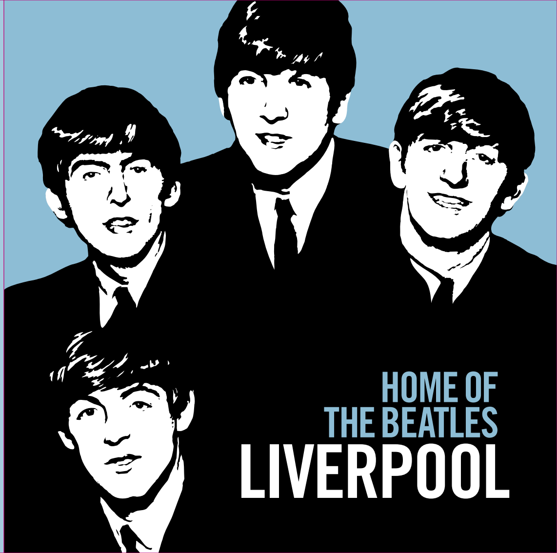
LIVERPOOL HOME OF THE BEATLES