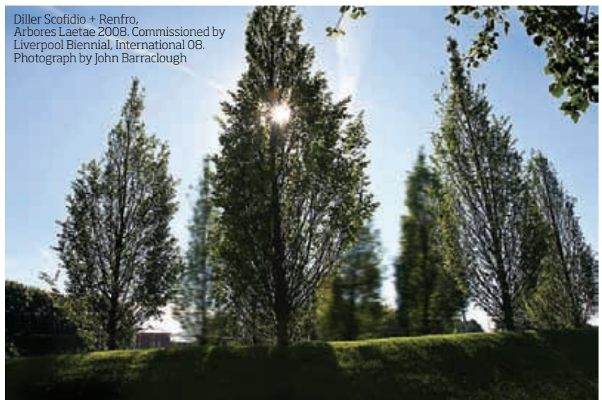
Diller Scofidio + Renfro, Arbores Laetae 2008. Commissioned by Liverpool Biennial, International 08.

For full details, dates and booking information visit www.biennial.com